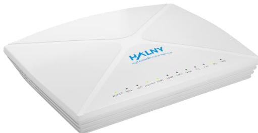
Fig. 1 - Front Panel