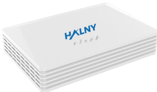
Fig. 1 - Front Panel