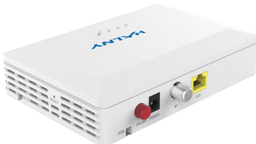
Fig 2. Rear Panel