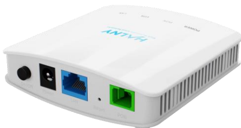
Fig 2. Rear Panel