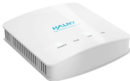
Fig. 1 - Front Panel