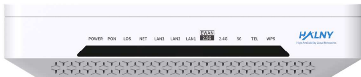
Fig1. Front Panel

On the front panel a row of LEDs is placed. Those LEDs allows you to easily check the status of the device and it's interfaces.