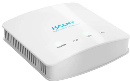
Fig. 1 - Front Panel