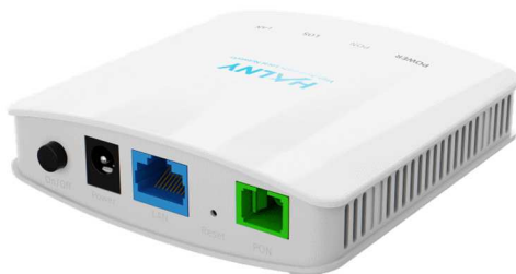
Fig 2. Rear Panel