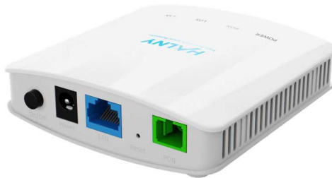
Fig 2. Rear Panel