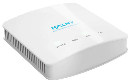
Fig. 1 - Front Panel